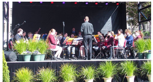
NTHS/OHS Combined Bands, 150th Anniversary, Hobart Town Hall